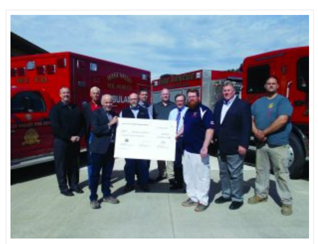
Representatives from the U.S. Department of Energy, the New York State Energy Research and Development Authority and CH2M HILL BWXT West Valley, LLC present a check to the West Valley Volunteer Hose Company.

WEST VALLEY – Representatives from the U.S. Department of Energy, the New York State Energy Research and Development Authority and CH2M HILL BWXT West Valley, LLC presented checks on April 23 to Springville Bertrand