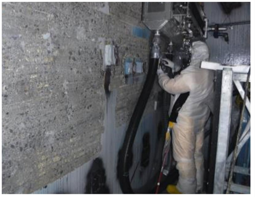
Radiological surveys are taken on the south wall of the PPC-S, after decontamination