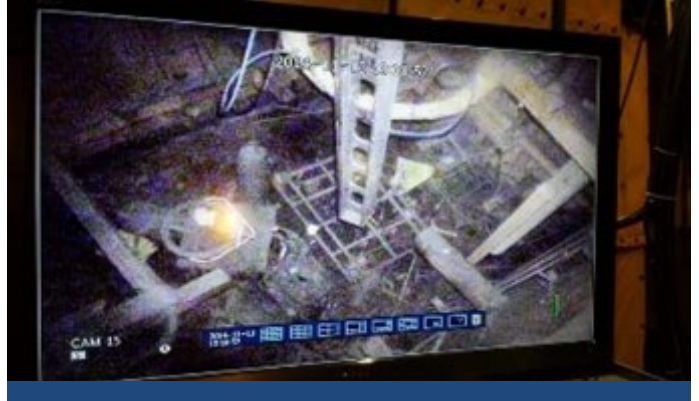
Extraction Cell-1 Before Deactivation